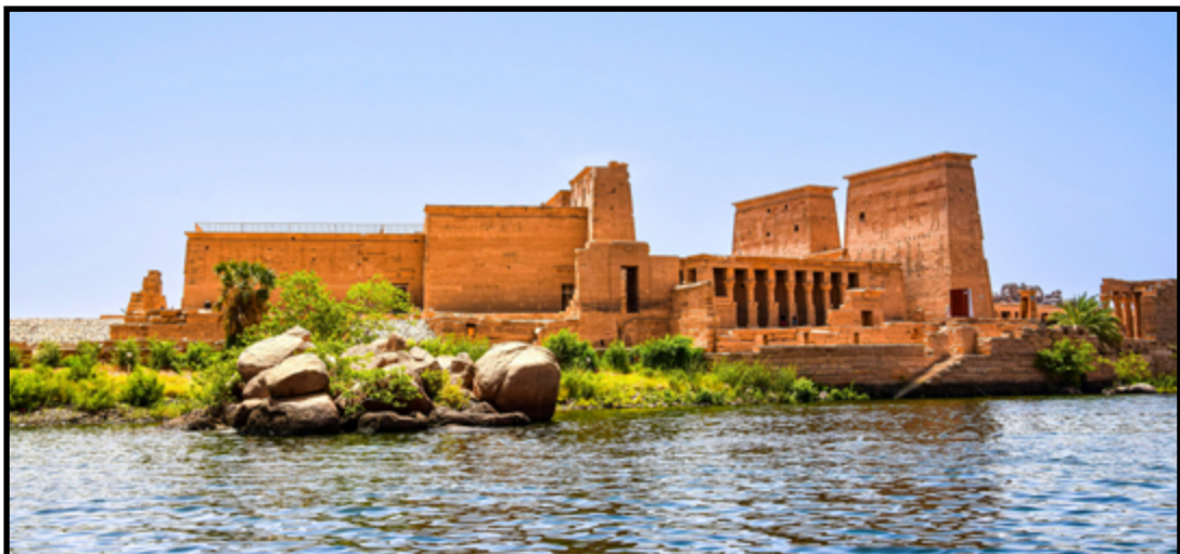
Philae temple complex, as seen from the Nile River in Aswan, Egypt.

After this, I participated in a Rosicrucian Initiatic Journey through Egypt. When we experience these, we have ceremonies at different places with very special energy along the Nile in the ancient temples there. Usually, the initiations are for two or three weeks, so we move out of our typical perception, our typical awareness through the five senses. The initiatic journey in Egypt was completely transformative for me, continuing my Rosicrucian initiation.