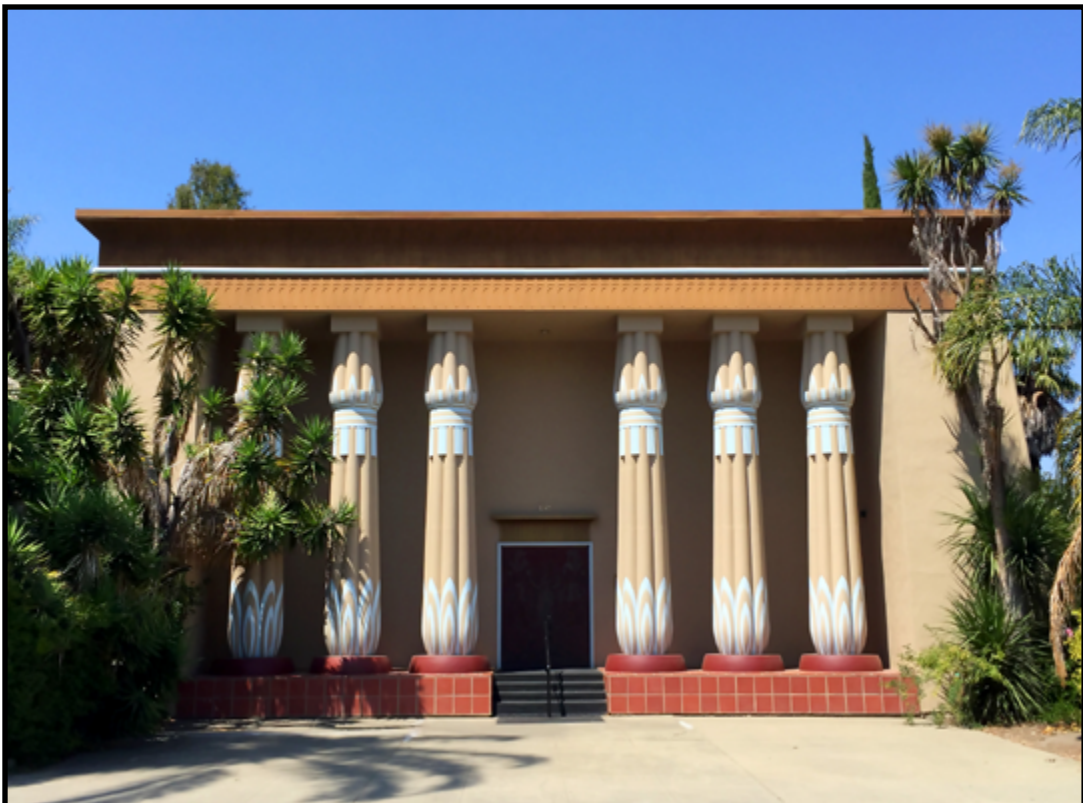
The Grand Temple at Rosicrucian Park.

We can also expand our perception beyond the usual limits of time and space. H. Spencer Lewis created the meditation for the Celestial Sanctum. The Celestial Sanctum is the highest plane of consciousness with which we can attune. That is a little bit abstract though so he created a technique so that we could visualize that. But first, he has us ascend above where we are seated, above our town, above our country, to snap us out of the conditioning of time and space because where the experience of awe is